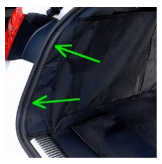
Figure 3 - Tuck leading edge behind rubber seal