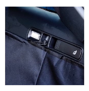
Figure 2 - Bungee eye attaches to side hook