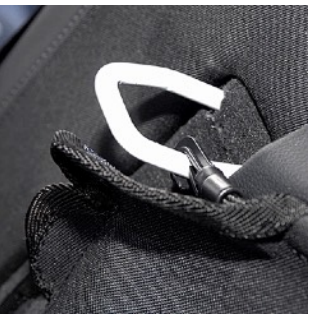
Figure 1 - Plastic hook attaches to seat locking point

11. If you install this piece, before you start you'll need to cut the supplied Velcro as follows: 22 x 2" pieces. Attach the pieces of Velcro that you've cut directly to the sewn in Velcro points on the tailgate protector and using the liner as a guide fix to the upper tailgate.